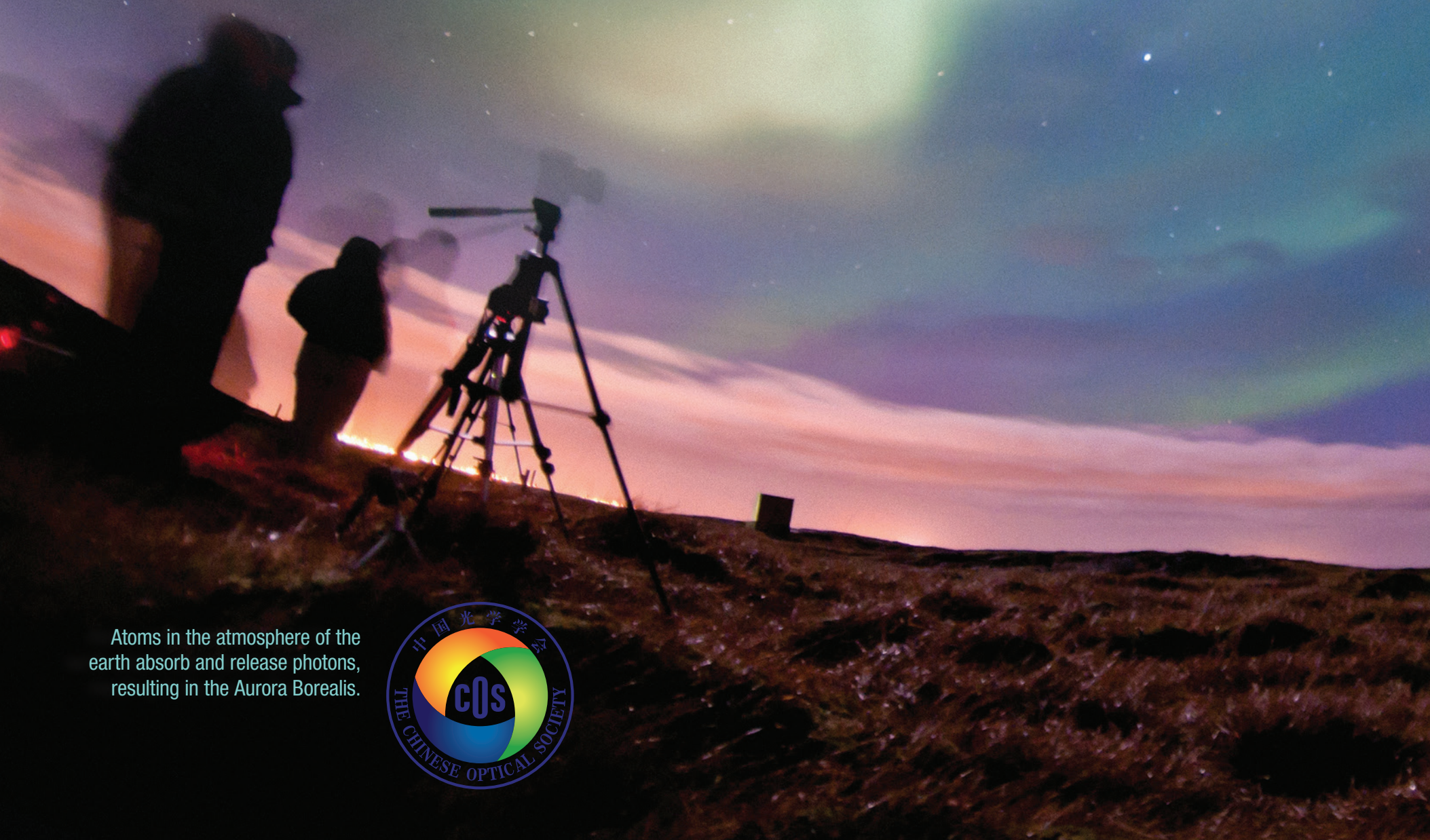
Atoms in the atmosphere of the earth absorb and release photons, resulting in the Aurora Borealis.