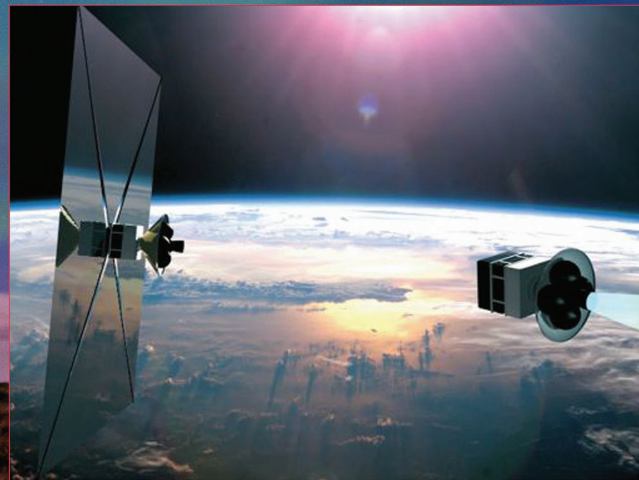
A solar sail propels a spacecraft because photons from the sun transfer their momentum to the ultralight sail.